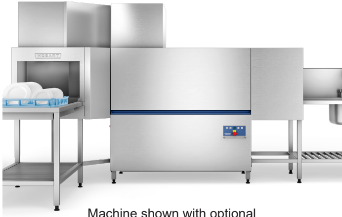
Machine shown with optional CDC-90 degree corner dryer

Automatic rack-type dishwasher, capacity up to 200 racks, 3.600 plates or 7.200 glasses per hour